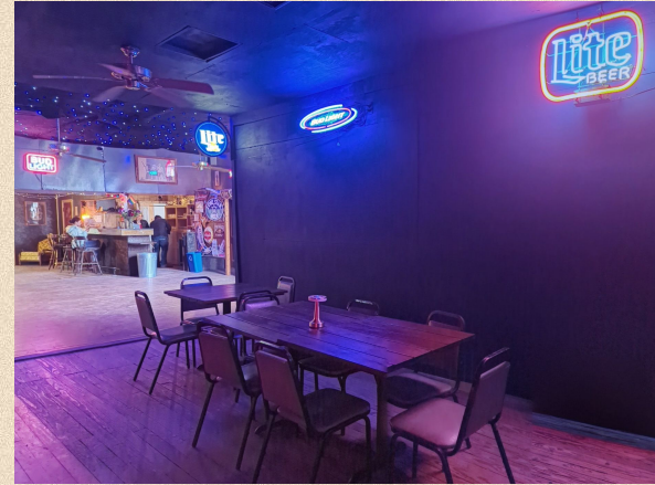
"The Barracks" Space